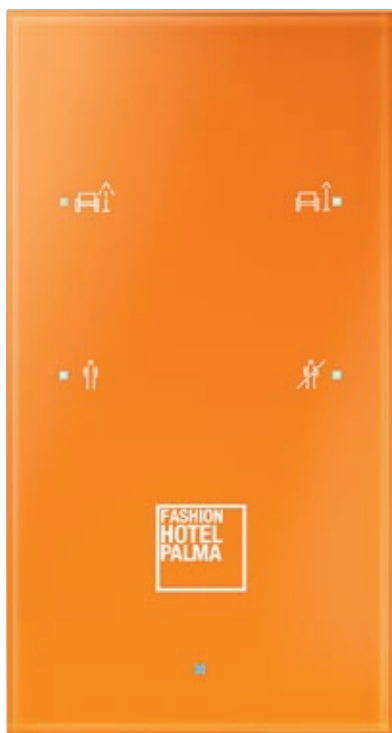
Berker TS Sensor, made to order in orange with labelling

Besides a free choice of lettering and symbols, the Berker Manufacturing can be used to realize virtually any desired feature: colours, logos, pictures or drawings as a background are no problem. Within the limits of what is technically possible, there is only one defining force: your imagination.