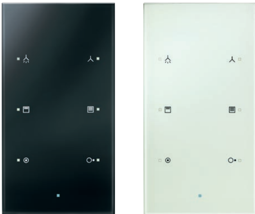
Berker TS Sensor in black and polar white with symbols, right-hand side aluminium in actual size 86 x 160 mm

For even more individual designs or labelling requirements for the Berker TS Sensor, the Berker Manufacturing can implement the solutions you need.