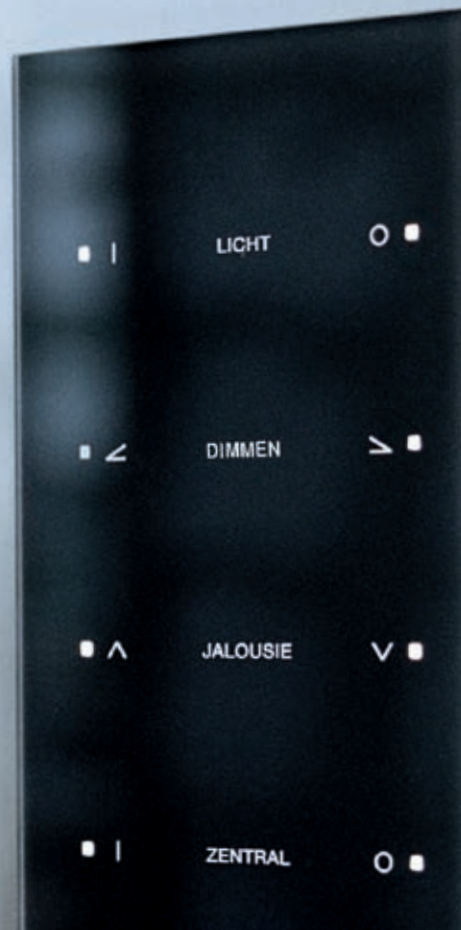
Berker TS Sensor, Customized, in black